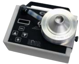
BioStage mounted on QuickTake 30 Pump with mounting bracket accessory