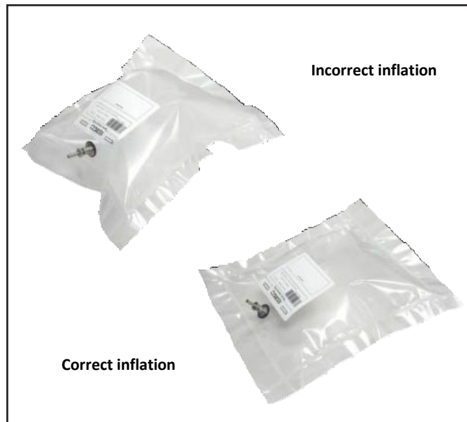
Figure 3. Bag Inflation